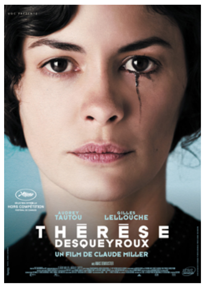
Thérèse Desqueyroux, Cornerhouse