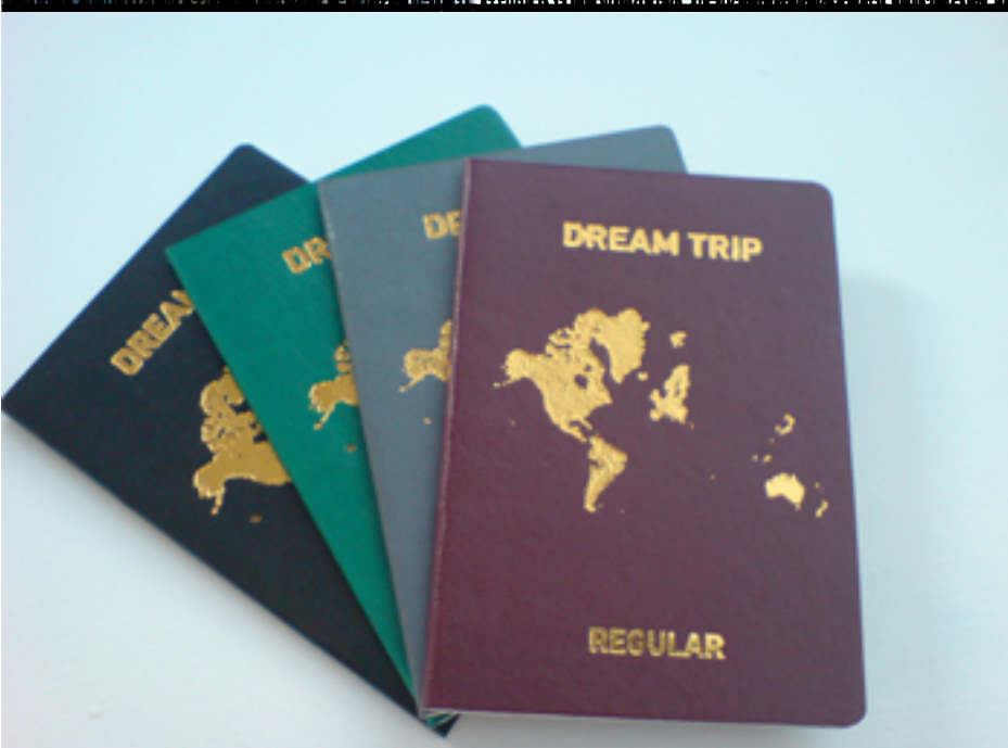
Castlefield Gallery, PiST//, Manchester triennial 2011