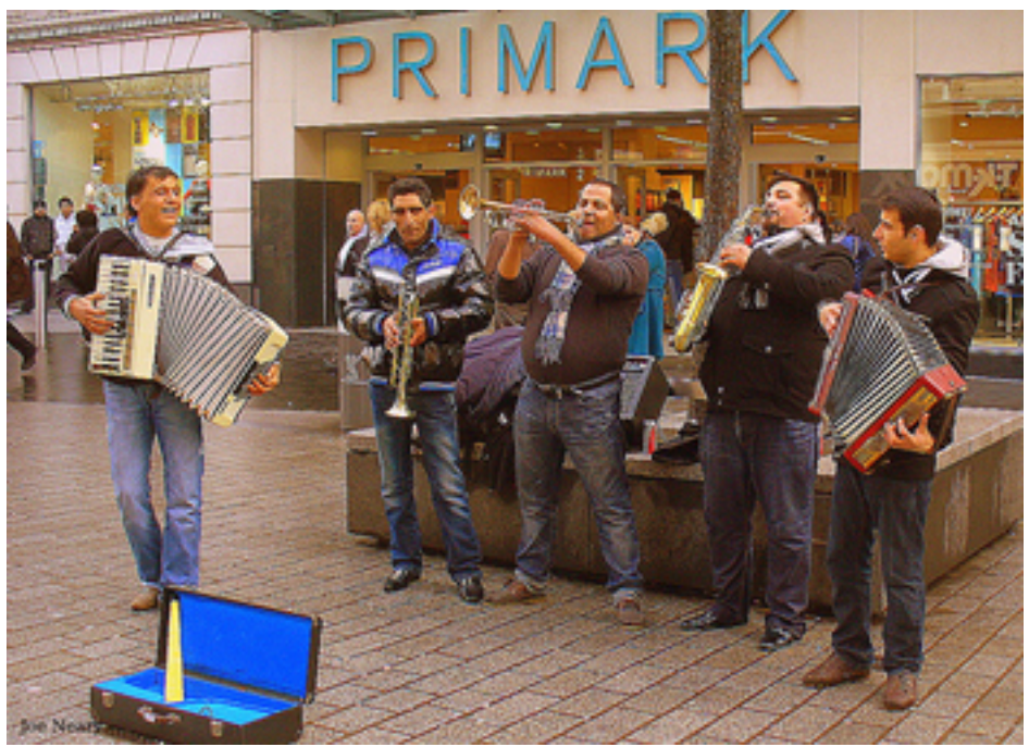
Liverpool busking permits will choke city life