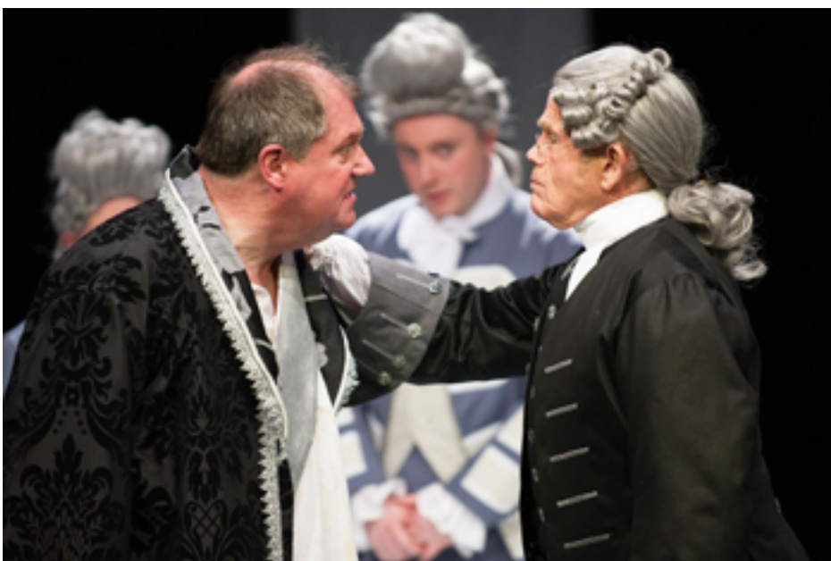
King George III

Missing Elements/bit more expansion of story: Mr & Mrs King in bed, she makes reference to a lady in waiting who is heavily pregnant and wants permission from the King to sit down during a forthcoming music recital – King says this is “preposterous & the next thing you know people with gout will want to sit down – where will it end” and refuses. However, come the day of the concert, said lady in waiting is nowhere to be seen, now surely he would have questioned her absence as it looks as though she is not attending because the King would make her stand! But more importantly the whole court would have witnessed her distress at having to stand and no doubt wonder why the King is so harsh (unfeeling or out of sorts!!). ***Point is also that having seen the film, probably slightly biased as this scene was in – same goes for other points***